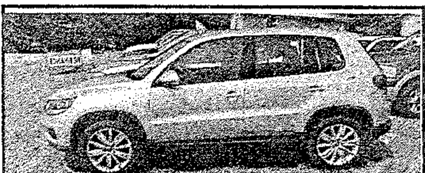
Tiguan, Great Gas Mileage Only $2500 Down Delivers*