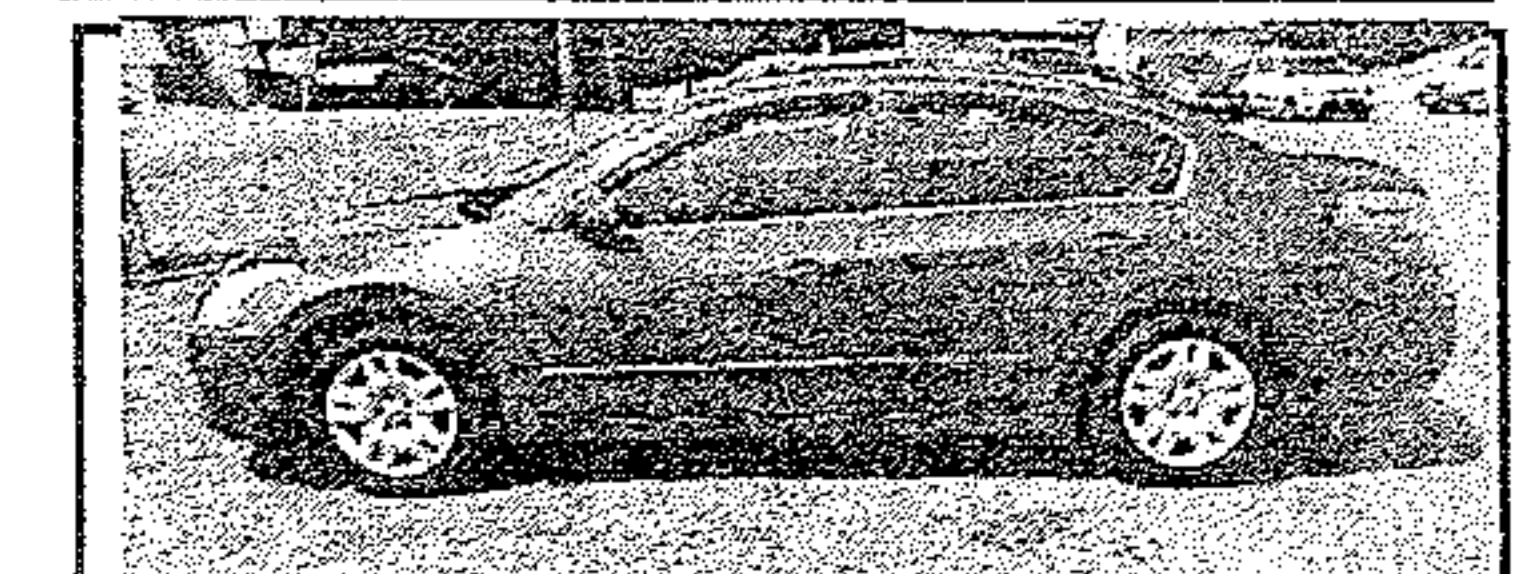
Altima, Extra Clean Only $2500 Down Delivers*