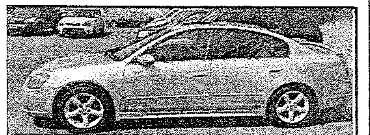
Altima, Auto, Loaded, Great Gas Mileage Only $1500 Down Delivers*