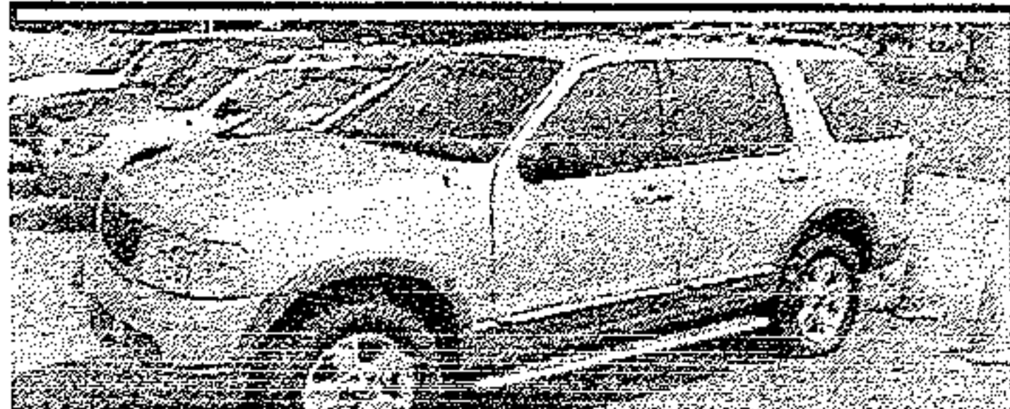
Explorer, 3rd Row, Ex. Clean Only $1800 Down Delivers*