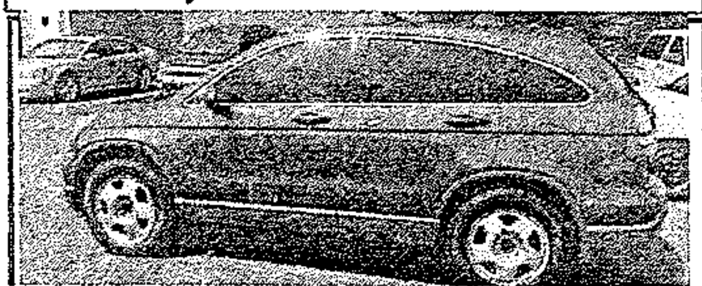
CRV, AWD, Runs Great Only $1800 Down Delivers*