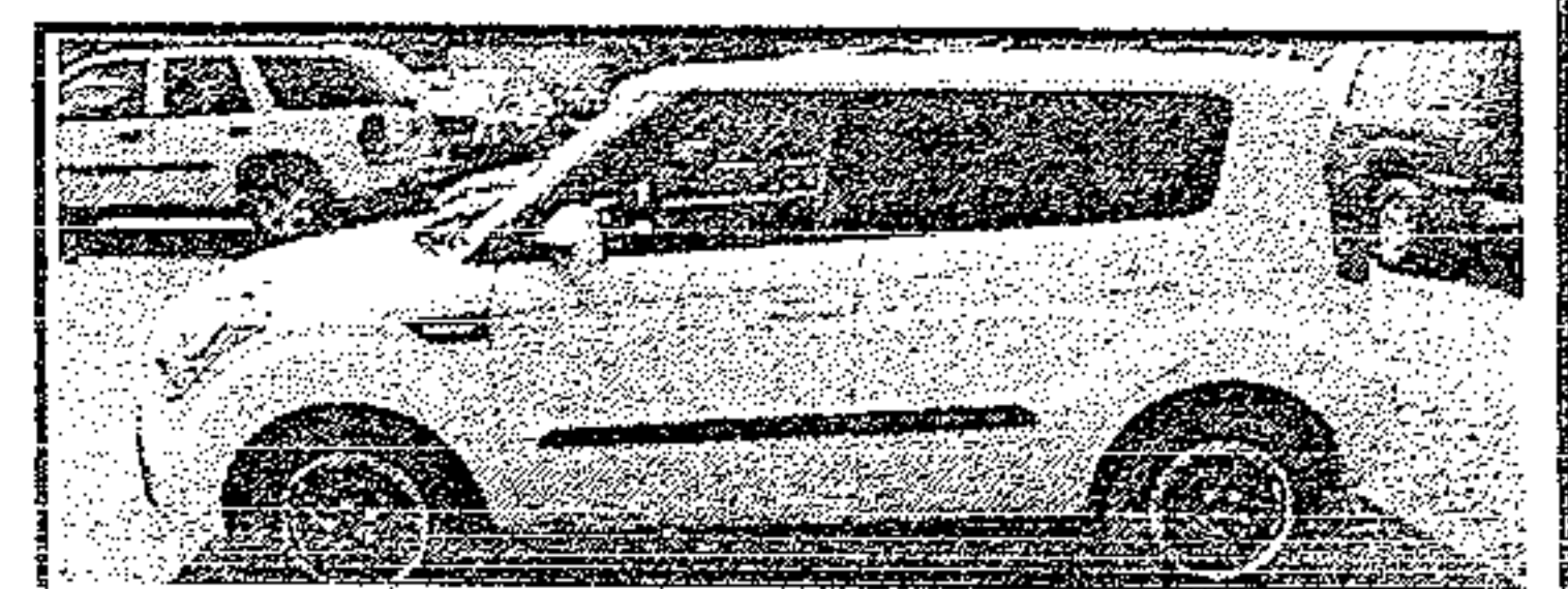
Soul, Auto, All Power Only $1950 Down Delivers*