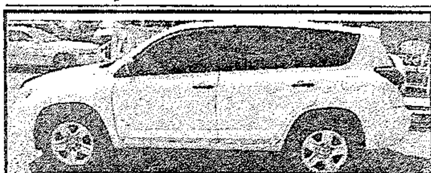
RAV 4, AWD, All Power Only $1700 Down Delivers*

Buy Here Pay Here No Credit Checks View our inventory: lenoircityautosales.com